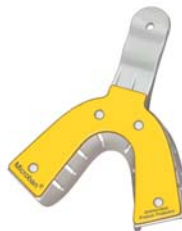
IT-103 Upper Large