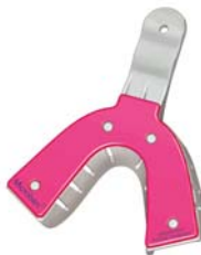
IT-102 Upper Medium