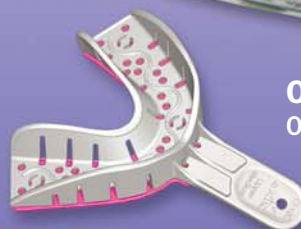
Originate™ Assortment Pack Order No. IT-ASST

The Originate™ Assortment Pack is a great way to start!