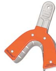
IT-202 Lower Medium