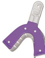
IT-201 Lower Small