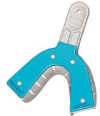
IT-203 Lower Large