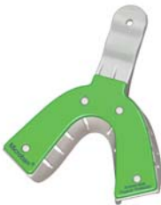
IT-101 Upper Small